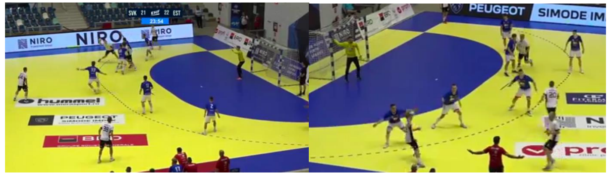
Fig 3. Images comparing the defensive structure of 6:0 defences between Ukraine, Romania & Slovakia.

Whilst it is difficult to compare only images, the above show a more compact version of a 6:0 played by Ukraine and Romania, who were less willing to open the space and thus having more help from other defenders to protect space around the 6m line. The images for Slovakia