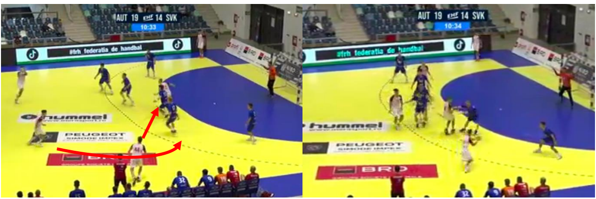
Fig 1. Images showing Austria's use of a right back entering as an additional pivot player to open a space to breakthrough between number 1 & number 2 defenders.

There were some teams who also used 7v6 as an attacking strategy. Estonia played 7v6 during the second half of their match v Austria – who defended with a 3:2:1 defensive system, they did also utilise this as a variation against Ukraine, and in both matches v Slovakia as an alternate strategy where all three teams defended with a 6:0 defensive system. Ukraine also used 7v6 to attacks during the second half of the final v Austria seemingly because of their 3:2:1 defence as well as for spells against Finland because of a 3:3 defence. Ukraine played this to try and chase the game, and as a reactive tactic to open defensive system as opposed to a primary attacking strategy and didn't use this against any teams who were defending with a 6:0 defensive system.