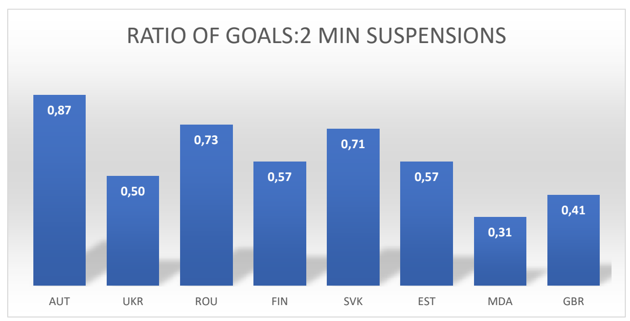
Table 5. Ratio of goals scored per 2 minute suspension ordered by team overall ranking.

In addition to this Austria were very interesting during the minority phase, they were very efficient at scoring in this phase of the game, scoring 15 goals in the 18 occasions they suffered a 2 minute suspensions, it isn't possible to directly attribute the amount of attacks played with a suspension but a ration 0f 0.83 goals per suspension was comfortably the highest proportion of all teams and is very positive in negating the impact of a 2 minute suspension. There wasn't a specific or completely new system for this, however there was again a theme of using right-handed right backs breaking through between number 1& number 2 defenders. Not only is this a clear structure to organise this phase of the game but uniquely attempts to create a higher quality shot.