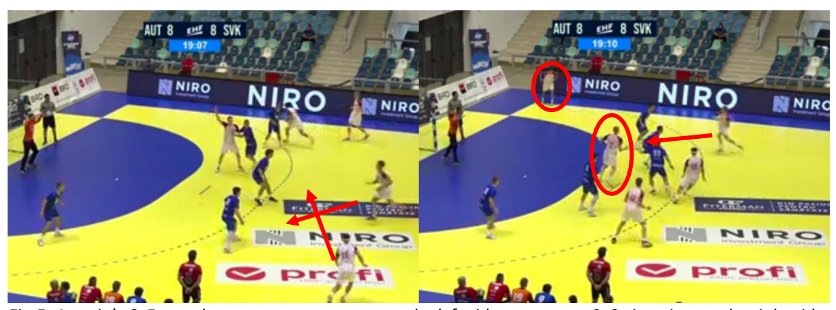
Fig 5. Austria's 6v5 attack system to use a cross on the left side to create a 3v2 situation on the right side.

Austria and Finland however used a crossing system to draw the defence onto one side and create a 3v2 on the other side of the court as seen in the images below.