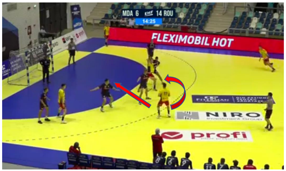
Fig 4. Images showing Romania's 6v5 attacking system.

Moldova used a screen similarly to what was highlighted in the first image, with only one pivot player as their primary strategy – Ukraine used this as an alternate system.