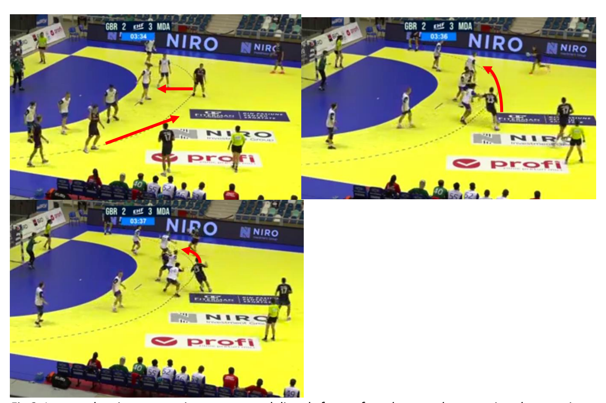
Fig 2. Images showing a screening system used directly from a free-throw under a passive play warning.

create a clearly defined scoring chance aiding the chance to score whilst under pressure as well as allowing players to better organise the return defence phase to prevent fast break goals against them.