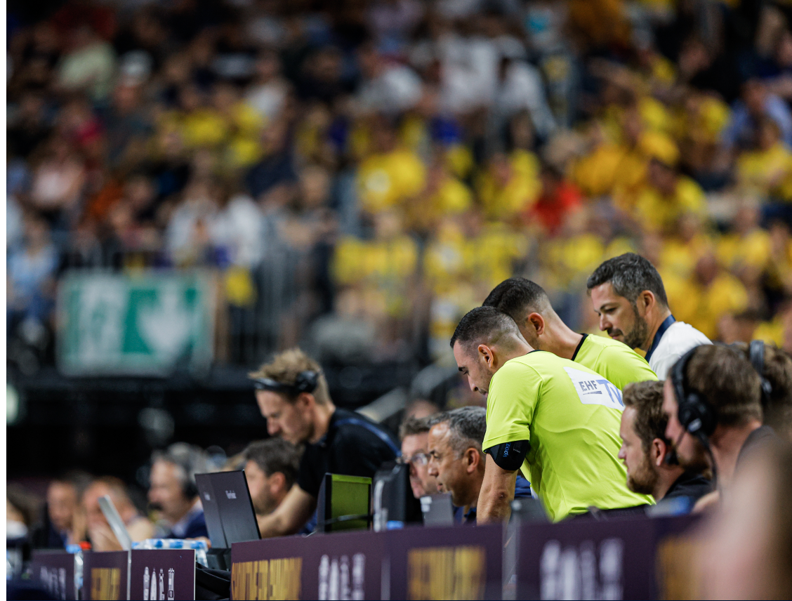
Table: The EHF delegate(s), the scorekeeper, and the timekeeper.

Substitution area technology: A system (micro cameras) providing a detailed view of both substitution areas, offering video assistance in case of decisions that concern the substitution areas.